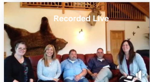
TWC Facebook LIVE from Alaska!