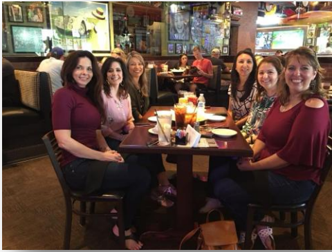
TWC Luncheon – many of our members came together to share the LIVE call.