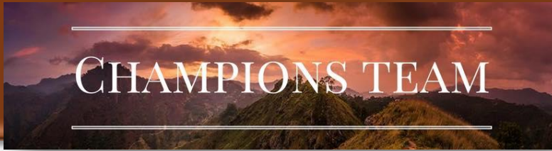
Lecia Retter Champions Team Coach

“Champions Team is a company of warriors who have decided to run harder, go faster, climb higher and endure longer through a group mentoring process. Momentum is key in everything we do! Available through application after completion of Level 1, we build community through team and training calls, Facebook conversations and pouring back into the TWC community in various ways. We are discovering many upgrades to add to our walk.