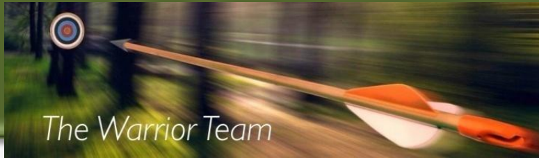
Judy Austin Warrior Team Coach

“Warrior Team is a group of warriors, pioneers and explorers who continue to strengthen their training and community through a focused, self-paced training. We climb to new altitudes, acclimate and passionately pursue our growth through all training levels and modules. We are team coached and given opportunities for training and idea exchanges through conversational calls, specialty training, and an increasing variety of media.”