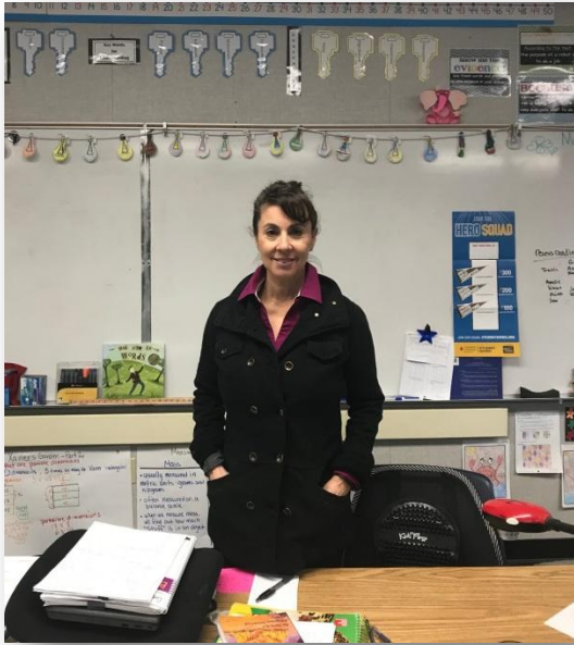
This is my classroom, where I love teaching!

I love the gentleness of our God! I find that He also is quite multidimensional. I guess that's why He made me the same. I find that I connect with different aspects of His nature depending on the circumstance I'm dealing with. When weariness knocks, I identify with the Everlasting God that Never grows weary, (Isaiah 40:28-31) "and gives power to the faint; and to them that have no might he increaseth strength that we may mount up with wings of eagles." If fear attempts to creep in, I identify with the Lord as my covering and protector. I have a plethora of promises that assure me that I need not fear because the Lord, my God, is the light of my salvation; whom shall I fear? (Psalm 27:1). He is my refuge and strength and He hides me in my secret place because I can now abide in Him (Psalm 91:1-2) with confidence because I AM the beloved.